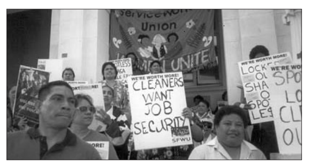
Contract cleaners fight lockout by employer over industrial democracy rights in collective bargaining.

iv) a requirement to recognise the role and authority of the representatives, a prohibition on bargaining directly or indirectly with those represented in the bar-