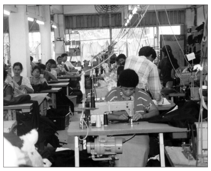
Typical garment factory.

Employees not belonging to a recognised trade union have the right to lodge a complaint directly with the Labour Department. The complaint may be filed at the office or in writing. Following receipt of a complaint, inspectors conduct an investigation and if need be de-