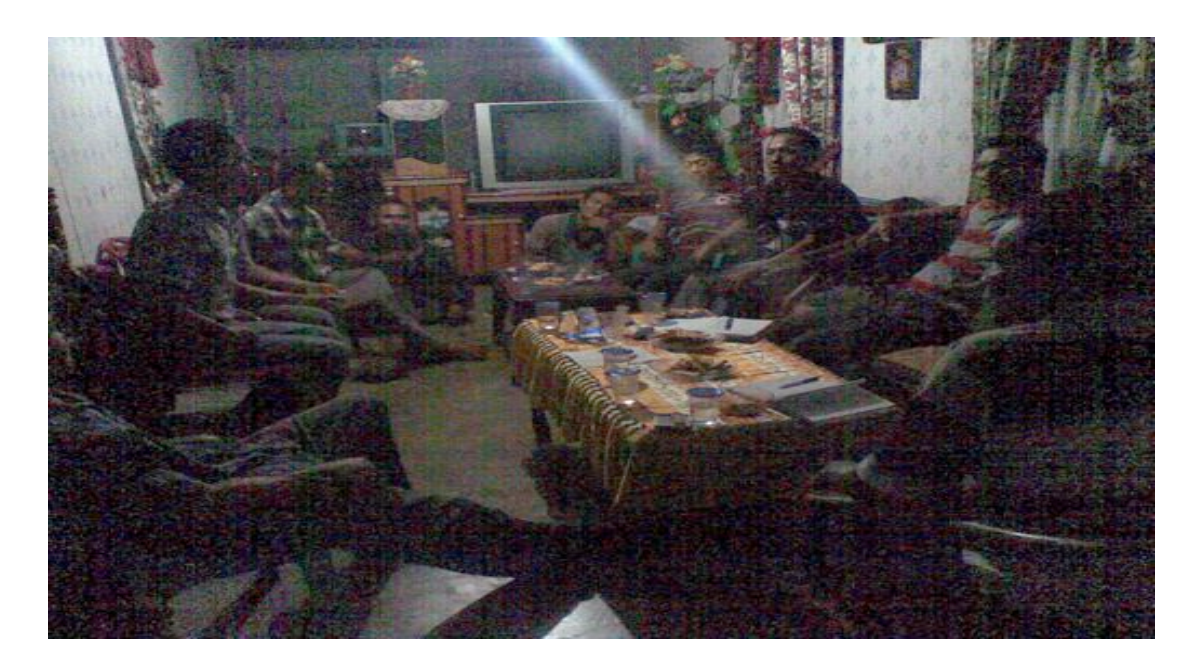
Discussion with workers from PTPN II and Puskopad Estate. The workers argue that casualization of work in the plantation industry has disadvantaged workers. Long working hours, low pay and unpaid family workers.

In Percut Sei Tuan, just like other districts in North Sumatra province, land seizure involves violence by military and police. Community resisting the land seizure is stigmatized as communist, justifying the army to ransack the whole village. In the end, due to survival demands, the landless sells their labour to the plantation. So, peasant-labour transformation applies here.