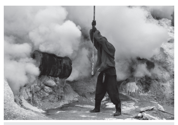
Sulphur mine worker in Ijen Mountain, East Java, Indonesia.

employers also view OSH very simplistically, and this must change. They see it as an added cost to business and as something that can be addressed by a quick token gesture like providing gloves or a dust mask. Safety is not considered an important aspect of the company culture, even when zero accident campaigns are espoused